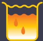
Blood in urine 1