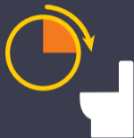
Frequent urination or pain when urinating 1,2